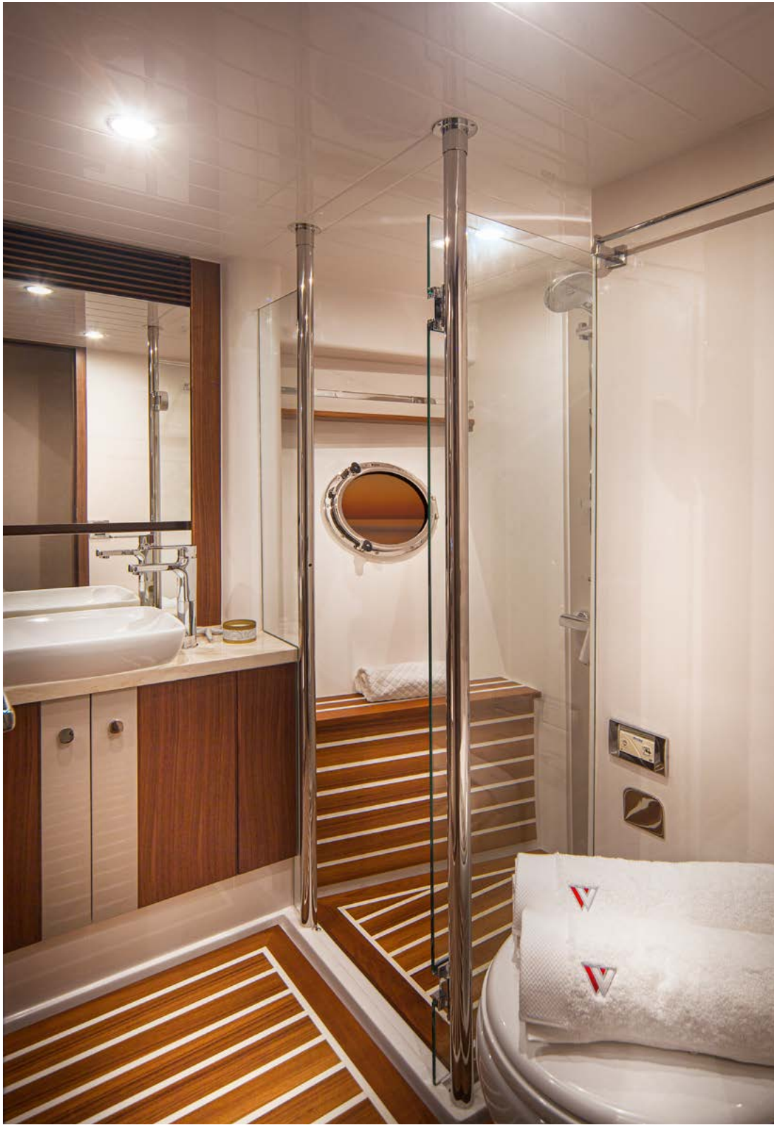
Far left - Starboard stateroom.