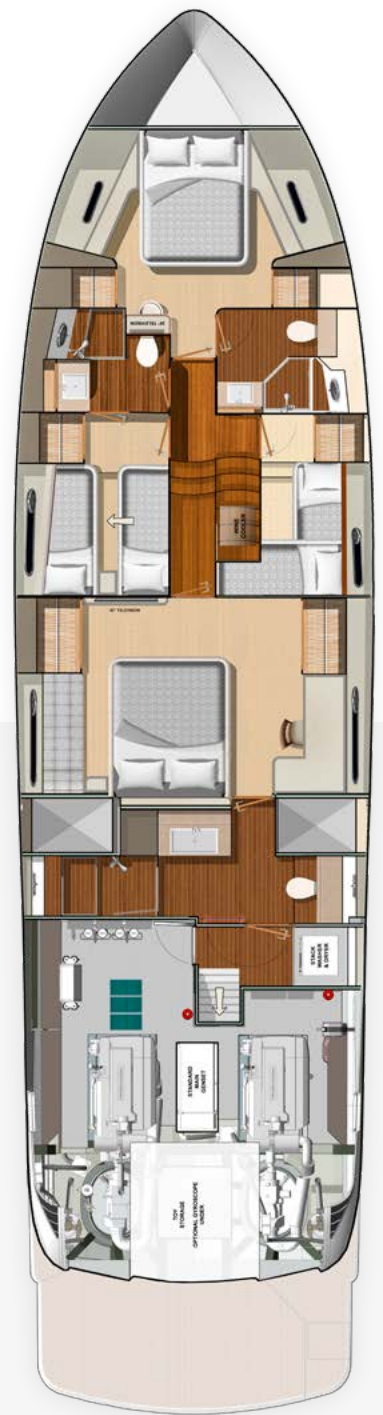
ACCOMMODATION DECK Presidential 4 stateroom