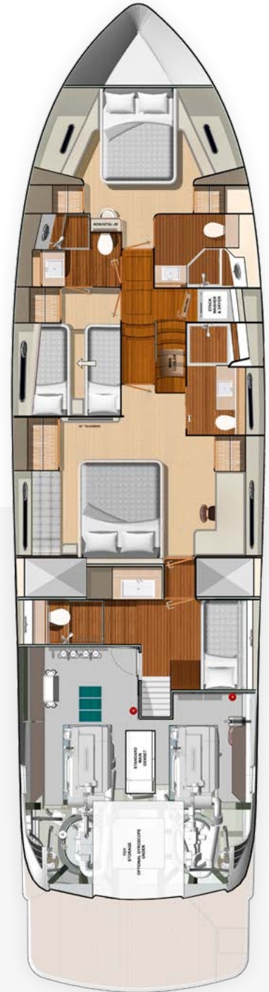
ACCOMMODATION DECK Presidential 3 stateroom — with aft crew