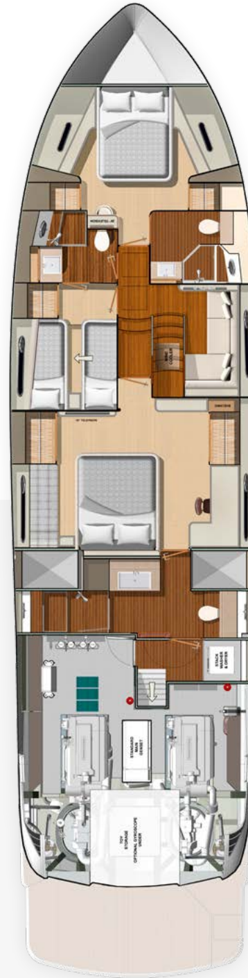
ACCOMMODATION DECK Grand Presidential 3 stateroom