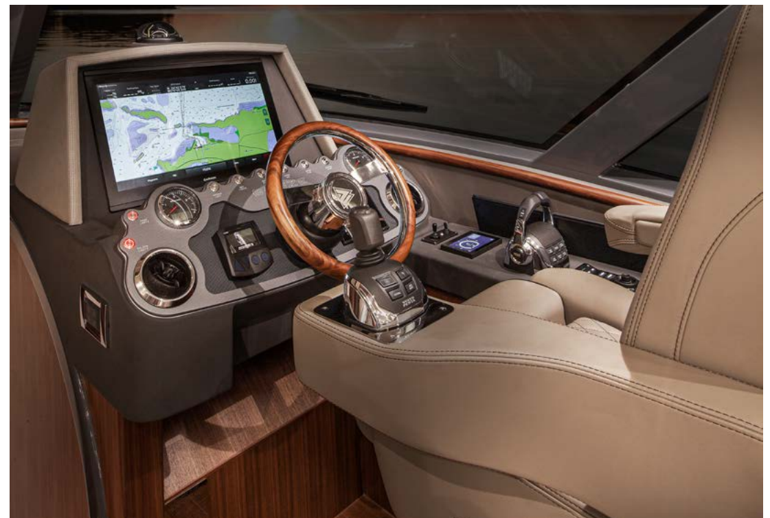
Right - Daybridge lower helm option shown.