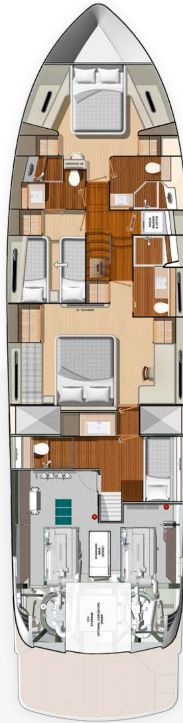
ACCOMMODATION DECK Presidential 3 stateroom — with aft crew