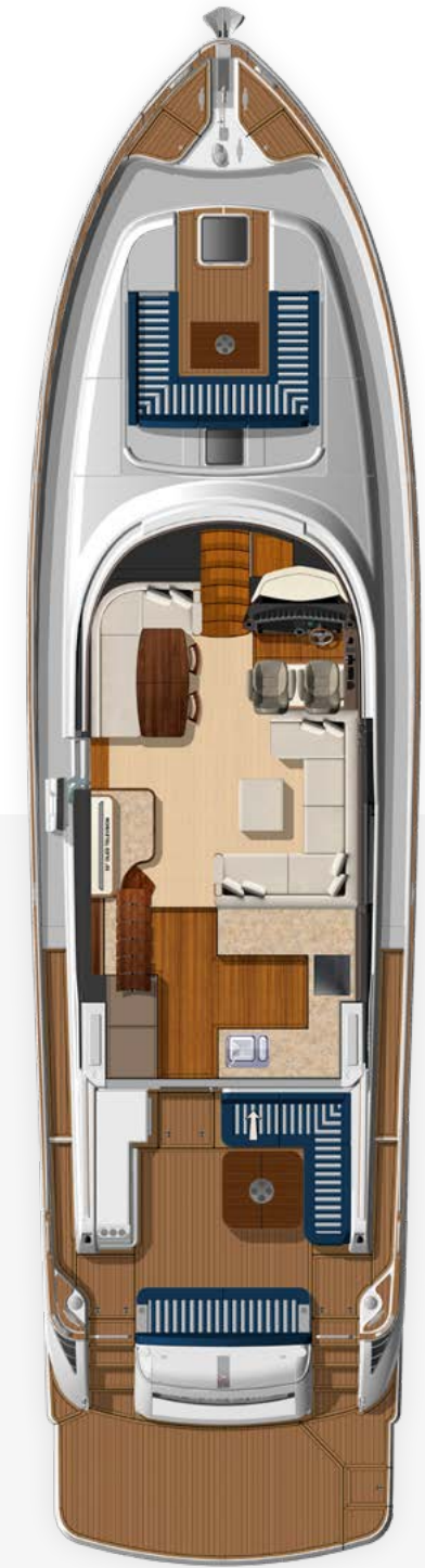
SALOON DECK Grande and Presidential 3 stateroom layouts