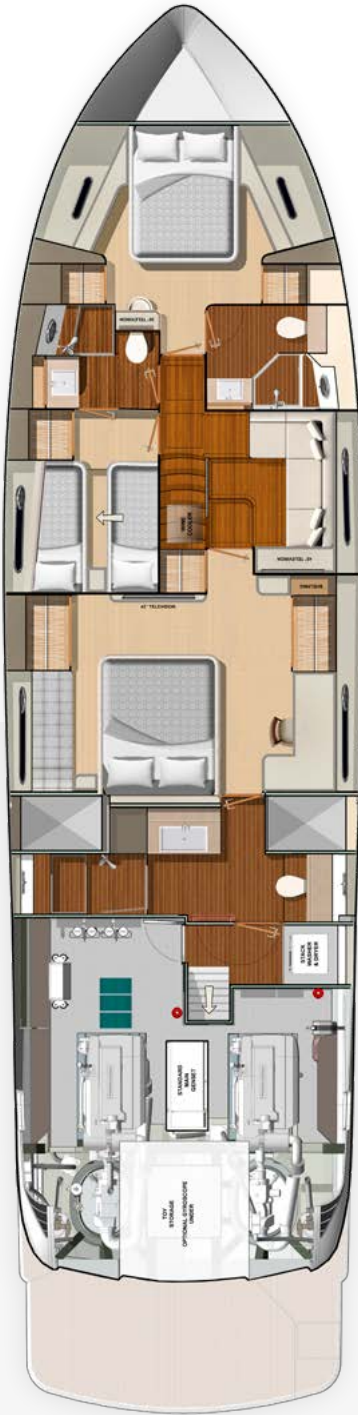
ACCOMMODATION DECK Grande Presidential stateroom