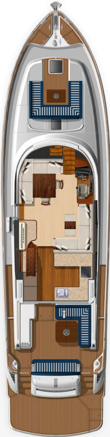
SALOON DECK Presidential 4 stateroom layout